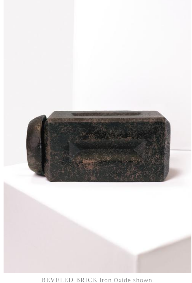
BEVELED BRICK Iron Oxide shown Size 1". Available in all colors.