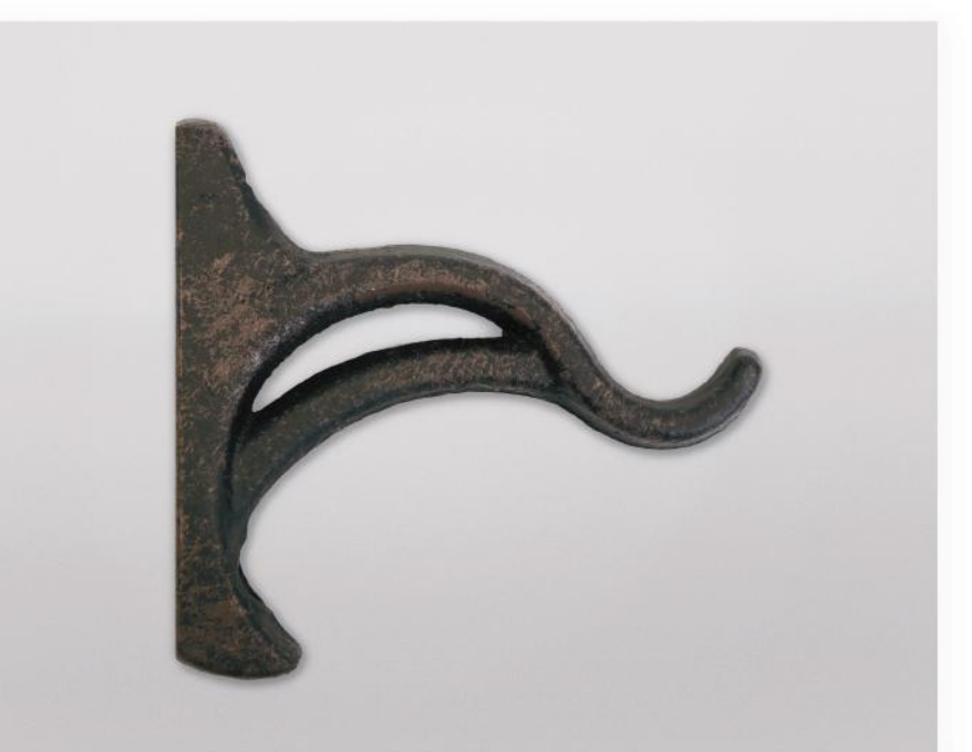
CENTER BYPASS BRACKET Iron Oxide shown, 3½" return. Available in all colors.